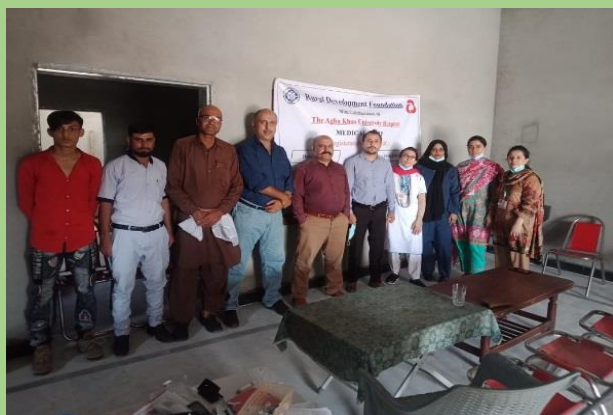
Group Photo of AKU Medical Team & RDF staff during medical camp

RDF in collaboration with Aga Khan University Hospital organized one day free medical camp in village Ghari Afghanan on 8 th July, 2021. In this medical camp